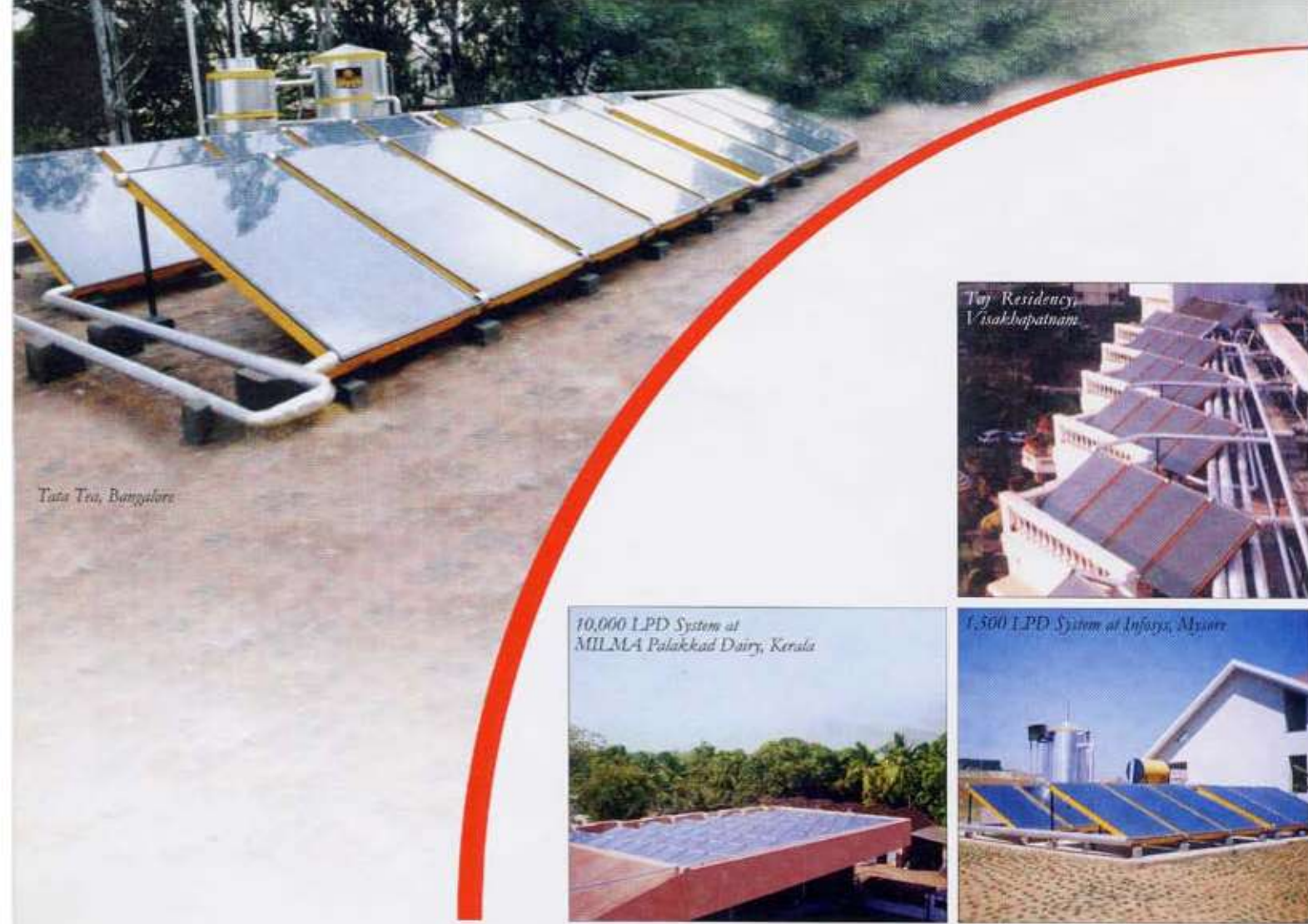
Tata Tea, Bangalore