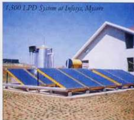
1,500 LPD System at Infosys, Mysore