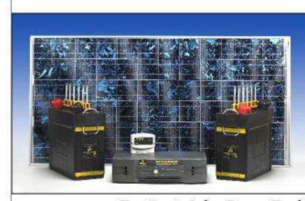
EcoGenie Solar Power Pack