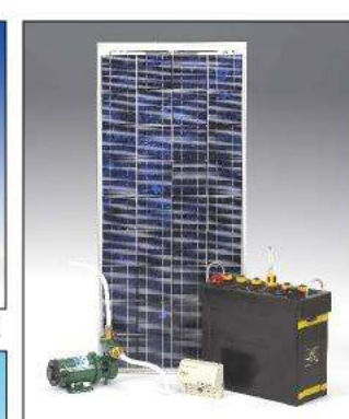
Lotus Solar Water Pump