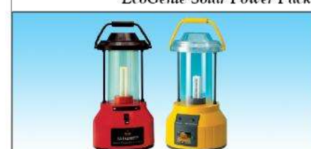
Tatadeep Solar Lanterns